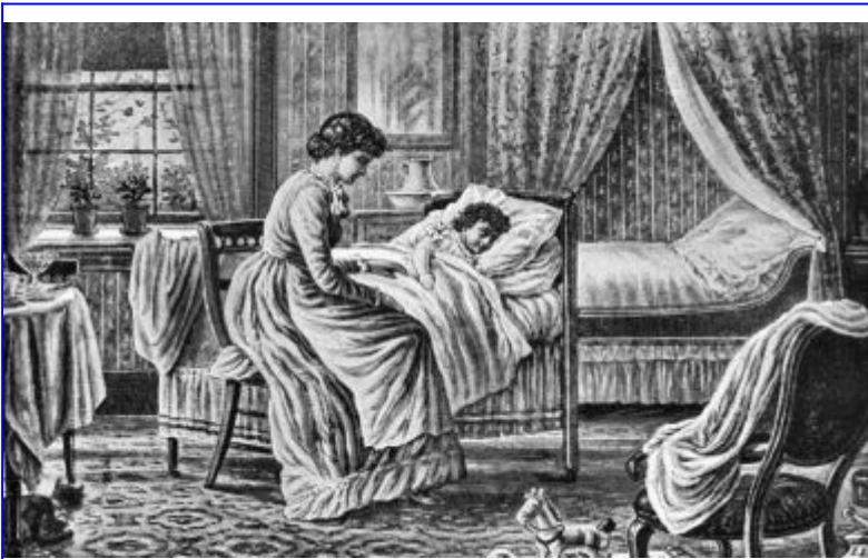
Illustration 5: Anxious Thoughts

imagination. Many other inventions are worthy of note, which have originated at the Menlo Park laboratory, but space forbids, although it is safe to predict that more startling inventions may yet be in store for an expectant world.