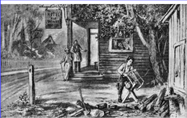
Illustration 2: Self-Reliance

As we review the various great and influential men we cannot but notice how many, out of the total number, cultivated a pleasing manner. Certain it is, to pleasing manners and ability owed he his success; without either he could not have succeeded. Without the generous heart he possessed he could never have won the great honor that he enjoyed, for great wealth alone could not bring such honor. He was a notable moral phenomenon. Of all the great and rich men of whom we are aware, none gave as liberally as did he. Reader, think of it; a poor boy who became