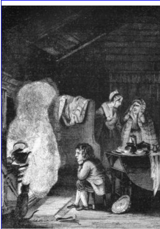
Illustration 4: Perception