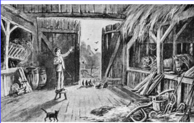
Illustration 3: Determination

Henry became a copyist in the office of the clerk of the Court of Chancery, at Richmond. Here he was enabled to begin the study of law, an opportunity which he at once embraced. While other boys were improving their time 'having fun,' he was studying, and so closely did he occupy his odd time that he was enabled to pass the necessary examination and be admitted to the bar at the early age of twenty. Two years later he moved "West," (he was enterprising), settling at Lexington, Kentucky, where he entered upon the practice of law.